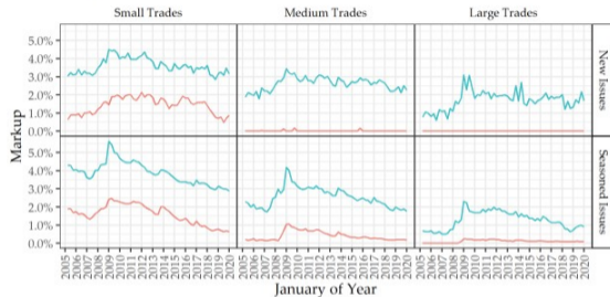
Panel B: New Issue Markups in Deals by Underwriter